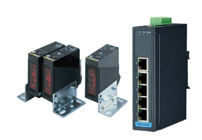
MOTION CONTROL & AUTOMATION