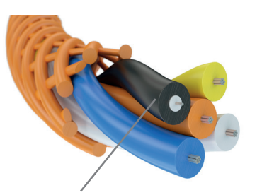
The heart of the technology: Silicone jacket element containing carbon black particles. It swells quickly by absorbing liquid hydrocarbon.

TTK hydrocarbon leak detection systems consist of FG-OD range sense cables, point sensors and FG-NET-LL range digital monitoring units.