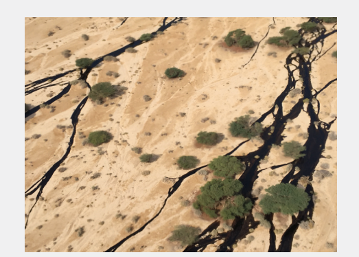
Oil spill at Evrona Nature Reserve

TTK hydrocarbon leak detection system in the Oil & Gas industry is specially designed to be installed in different environments, such as tank farms, pipelines, airports and refineries. The system is capable of detecting gasoline, fuel, crude oil, and jet fuel amongst others. Early detection with accurate location of oil leaks provided by the system allows reacting at a very early stage thus preventing environmental damage.