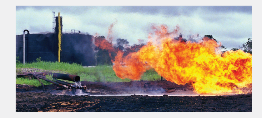
Oil contamination to water and land