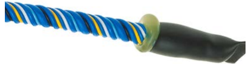
FG-ECS Sense Cable End Termination Tip

2 Communication Wires and 2 Wires for Locating