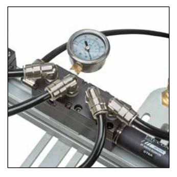
Multi-port Venturi Vacuum Pumps