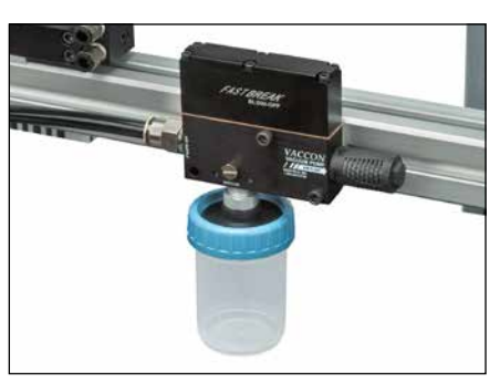
Modular Venturi Vacuum Pumps with Pneumatic Blow-off