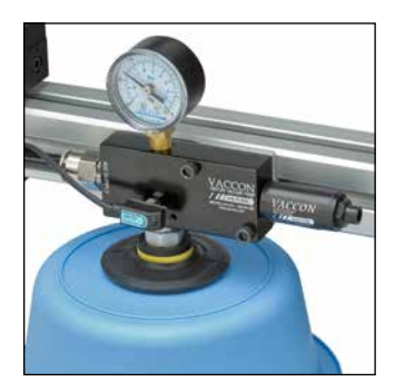
Modular Venturi Vacuum Pumps