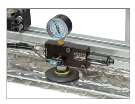
Mid Series Modular Venturi Pumps