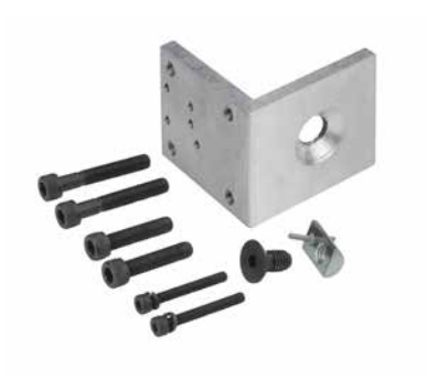
Angled Universal Bracket with optional mounting hardware