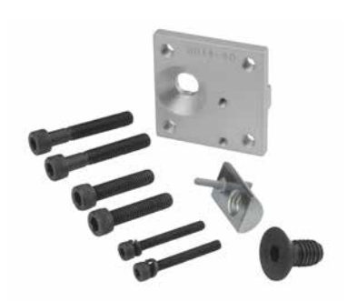
Universal Bracket (Fixed) with optional mounting hardware