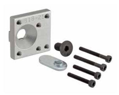
Universal Bracket (Fixed) with optional mounting hardware