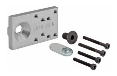
Universal Bracket (Adjustable) with optional mounting hardware