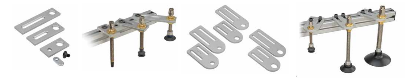
Spring leveler brackets and hardware for 1" [25mm] extrusions