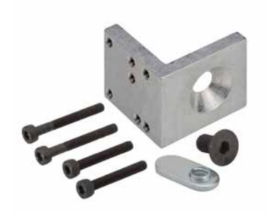
Angled Universal Bracket with optional mounting hardware