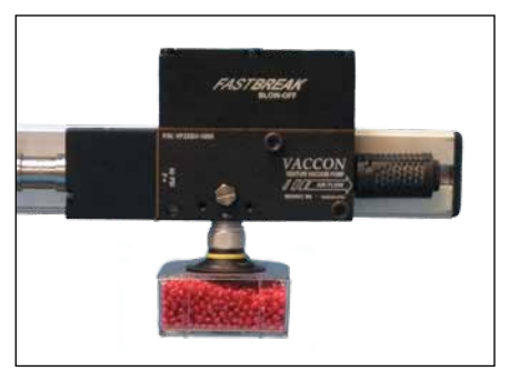
Modular Venturi Vacuum Pumps Solenoid Operated with Pneumatic Blow-off