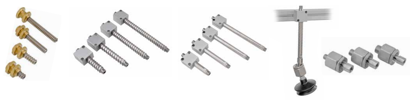
Spring Levelers VSL1, 2, & 3 Series