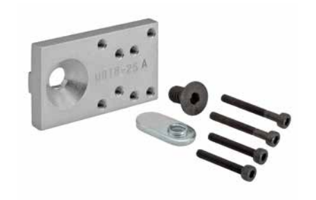
Universal Bracket (Adjustable) with optional mounting hardware