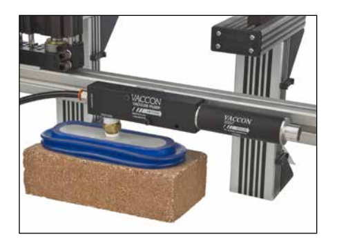
Max Series Modular Venturi Pumps