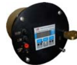
Lightweight Pneumatic Valve System