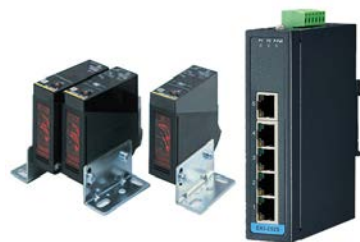
MOTION CONTROL & AUTOMATION