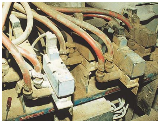
Concrete batching plant application. Ceram valves withstand harsh conditions and dirty air without "sticking".

Specified by industries that demand tough valves due to their harsh operating environment. Ceram™ valves are very prevalent where ordinary valves just don't last. Industries such as: tire plants, foundries, paper mills, steel plants, concrete batch plants, sawmills, plywood and board plants, automotive assembly, rubber and plastics glass manufacturers, smelting, sheet metal fabrication, etc.