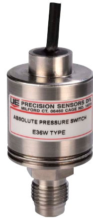
Absolute pressure switch

Loss of vac. detection Process pressure monitoring Factory set point Up to 180 deg. C