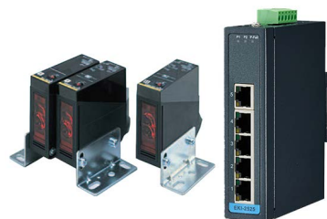
MOTION CONTROL & AUTOMATION