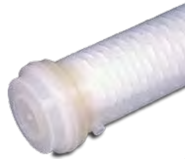
SOE Flat, Closed End

*Simple filter bowl modifications are required for this cartridge.