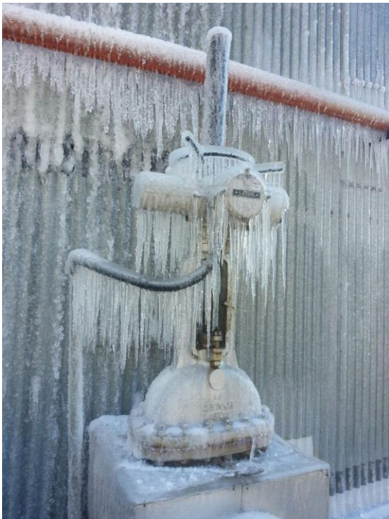
Fig 1 - Rotork IQ technology enables reliable operation without an internal heater at even the lowest temperatures.

The IQ3 actuator design enables it to operate reliably without an internal heater at even the lowest temperatures. The key to this proven benefit is the actuator's double-sealed enclosure, combined with 'non-intrusive' setting and commissioning. The separately sealed terminal compartment enables site wiring to be completed without exposing any internal parts to the ambient environment. Setting the switches and commissioning is performed with the 'non-intrusive' hand held setting tool without removing any covers. This means that the actuator is fully hermetically sealed from the time it leaves the factory and there is no opportunity for moisture to penetrate the enclosure in the field. Rigorous low temperature testing of the actuator's electronics and display window confirm that they operate reliably at very low temperatures and after long periods of inactivity.