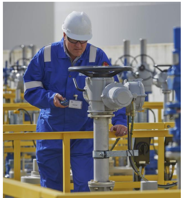
Fig 3 - Gathering the data for the Client Support Programme involves a visit to the site, but options to further enhance the service include a direct link between the master station and Rotork via the internet or the cloud.