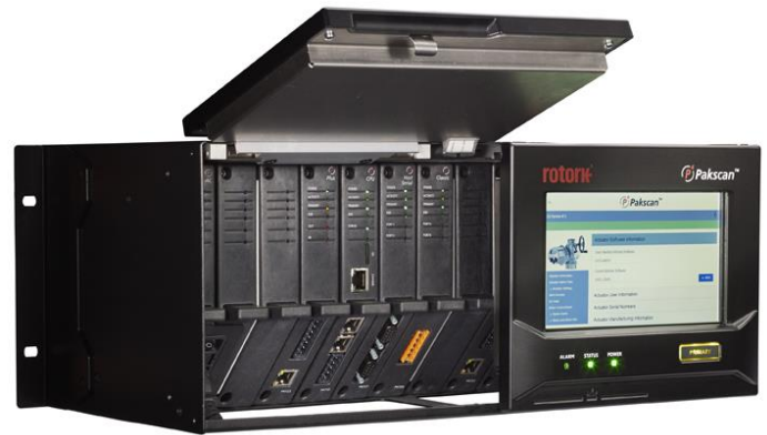
Fig 2 - Each Pakscan network, wired or wireless, is supervised by the Pakscan Master Station, which links the plant network with the control system. Pictured here, the latest Pakscan P4 Master Station has introduced an ultra-fast Plus network.

The expense inherent in traditional hardwiring, where more data demands more cables, is eliminated by the adoption of the digital control network. Reduced cabling complexity, reduced installation costs and the desire to obtain increased levels of information from the plant have all contributed to the development and adoption of the digital technology. Rotork has been a pioneer in this field and the Rotork Pakscan system, now in its fourth generation, is specifically designed for the valve actuation environment.