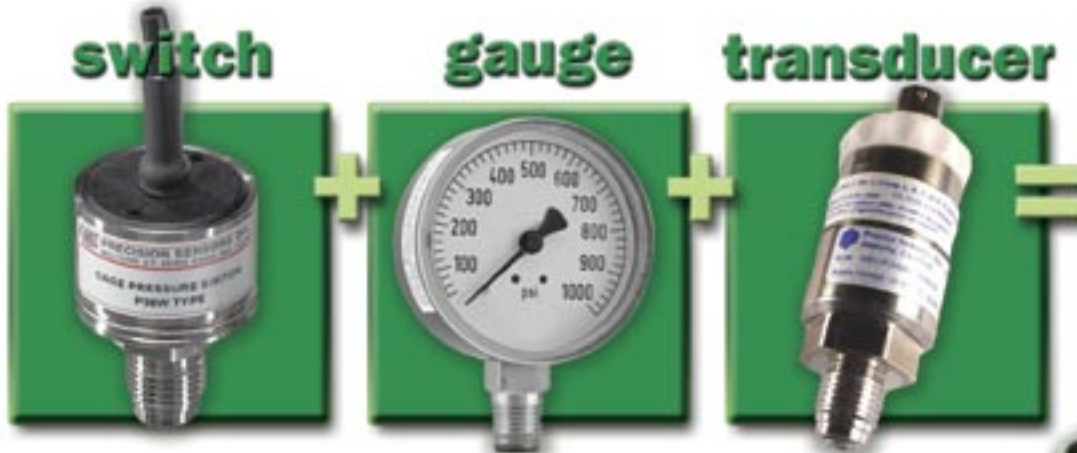
Safe, reliable threshold detection and control