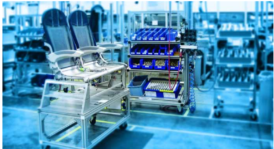
For assembly lines—of electronic components, passenger seats, or any subassembly—make sure you build in flexibility to incorporate changes later, if needed.

Many aerospace manufacturing facilities are large, which can lead to lots of wasted motion and movement, as well as excessive material handling. It might be worth spending a few dollars with a skilled lean consulting firm if you don't have a lot of experience with lean in-house. They can often get you started with the basics in a short period of time. They may have you do a waste walk with your lean leadership team. Take clipboards and notepads, and walk around in specific areas, looking for waste of the seven types mentioned above. You may be surprised at what you find. Do employees have to take a lot of steps to perform their tasks? Do parts or finished goods, or both, travel significant distances in the plant? If your team identifies waste of this type, then your next step is to